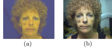
Figure 2. Examples of the sequestered database images. a : Controlled, b : Degraded

The sequestered BANCA data set consists of 21 of the original 52 database subjects, 11 men and 10 women. It was captured over 24 months after the original recordings. Five images of each client were captured under two scenarios, controlled and degraded. Also, images of 22 non BANCA subjects were captured under the two conditions. These images were used to simulate impostor attacks. The cameras used to capture the controlled scenario used was high quality